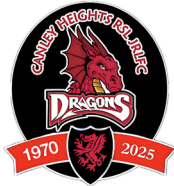
Rosford Street Reserve